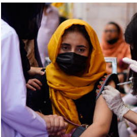
Hepatitis B and C Screening and Vaccination Camp August 12, 2021- De'montmorency College of Dentistry Community Health Camp