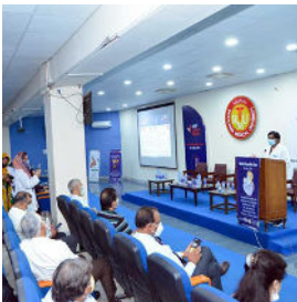
Hepatitis Ab Aur Nahi | Seminar Session 27 July, 2021- Rawalpindi Medical University Public awareness