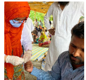
Hepatitis Screening Camp and Awareness Walk July 28, 2021- Panagaah, Holy Family Hospital, Rawalpindi Community Health Camp