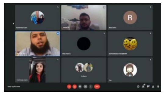
FOR THE RESEARCH