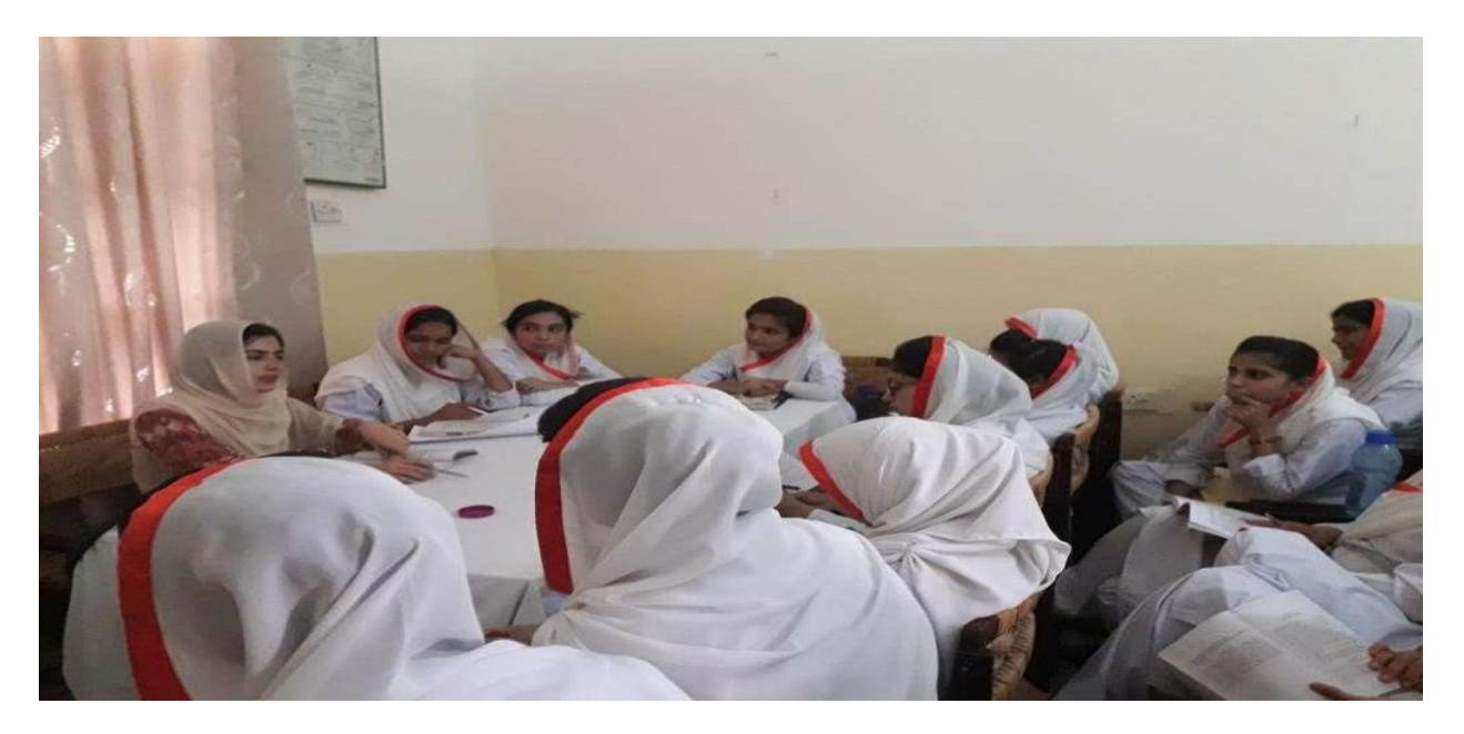
Provision of Family planning services to others departments:-

Regular training sessions are organized for nurses, LHV, Midwives at all family health clinics from time to time.